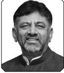
Shri D. K. Shivakumar Hon'ble Deputy Chief Minister of Karnataka