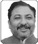
Shri Dayashankar Singh Hon'ble Minister of Transport, Govt. of Uttar Pradesh