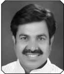
Shri Yoonus Khan Former Transport Minister Govt. of Rajasthan